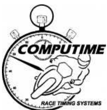
Clerk of Course - Peter Woods

COMPUTIME RACE TIMING SYSTEMS PTY LTD www.computime.com.au